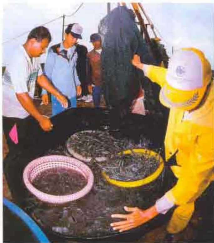
Tiger prawns ( Penaeus monodon ) are very popular, but their efficiency can be improved by changing the feeding strategy from multiple stage to a pellet-only dual stage pattern.

Due to this misconception on the eating behaviour of shrimp, this huge number of different feed types